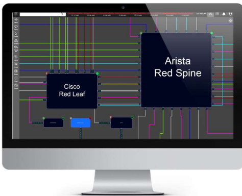
NVRT Real-time Topology Dashboard