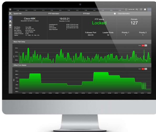
NVRT PTP Telemetry Dashboard